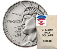
2026 Half Dollar- Enduring Freedom