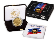
2026 Gold Proof Buffalo