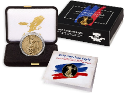
American Eagle 2026 Enhanced