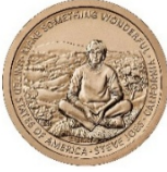
American Innovation Dollar (Bags and Rolls)- May 12th

Take a minute to look over what the U.S. Mint is releasing this month.