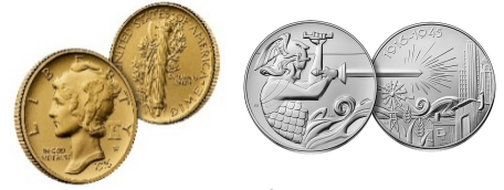
Best of the Mint 1916 Mercury Dime Metal Set-