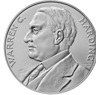
Warren G. Harding Silver Medal May 13th