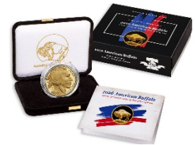
2026 Gold Proof Buffalo Price -TBA- May 7th