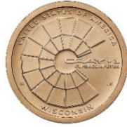
American Innovation Dollar (Bags and Rolls)- April 7th