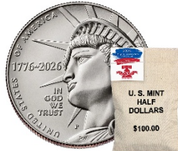
2026 Half Dollar- Enduring Freedom (Bags and Roll)- May 5th