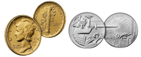
Best of the Mint 1916 Mercury Dime Metal Set- June 4th