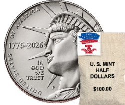
2026 Half Dollar- Enduring Freedom (Bags and Roll)- May 5th