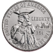
Revolutionary War Quarter March 27th