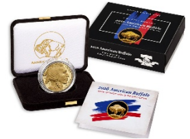
2026 Gold Proof Buffalo Price -TBA- May 7th