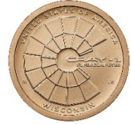
American Innovation Dollar (Bags and Rolls)- April 7th