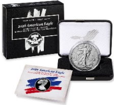
American Eagle 2026 Enhanced April 17th