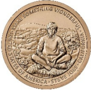
American Innovation Dollar (Bags and Rolls)- May 12th

Take a minute to look over what the U.S. Mint is releasing this month.