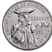
Revolutionary War Quarter