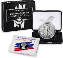
American Eagle 2026 Enhanced