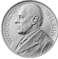
Woodrow Wilson Metal

Take a minute to look over what the U.S. Mint is releasing this month.