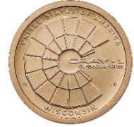
American Innovation 1 dollar