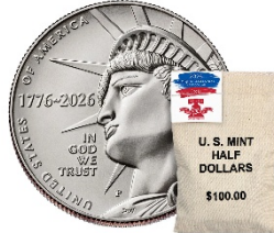
2026 Half Dollar- Enduring Freedom